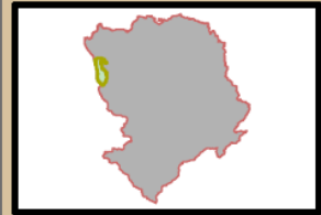
Upper Murray River