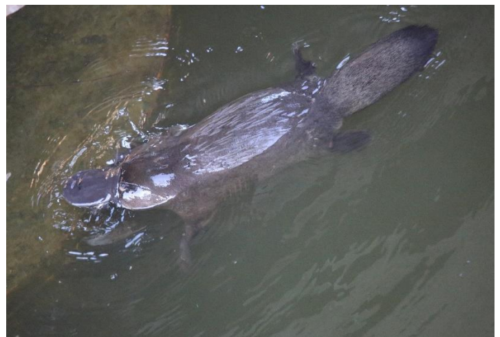
Platypus in Sunday Creek.